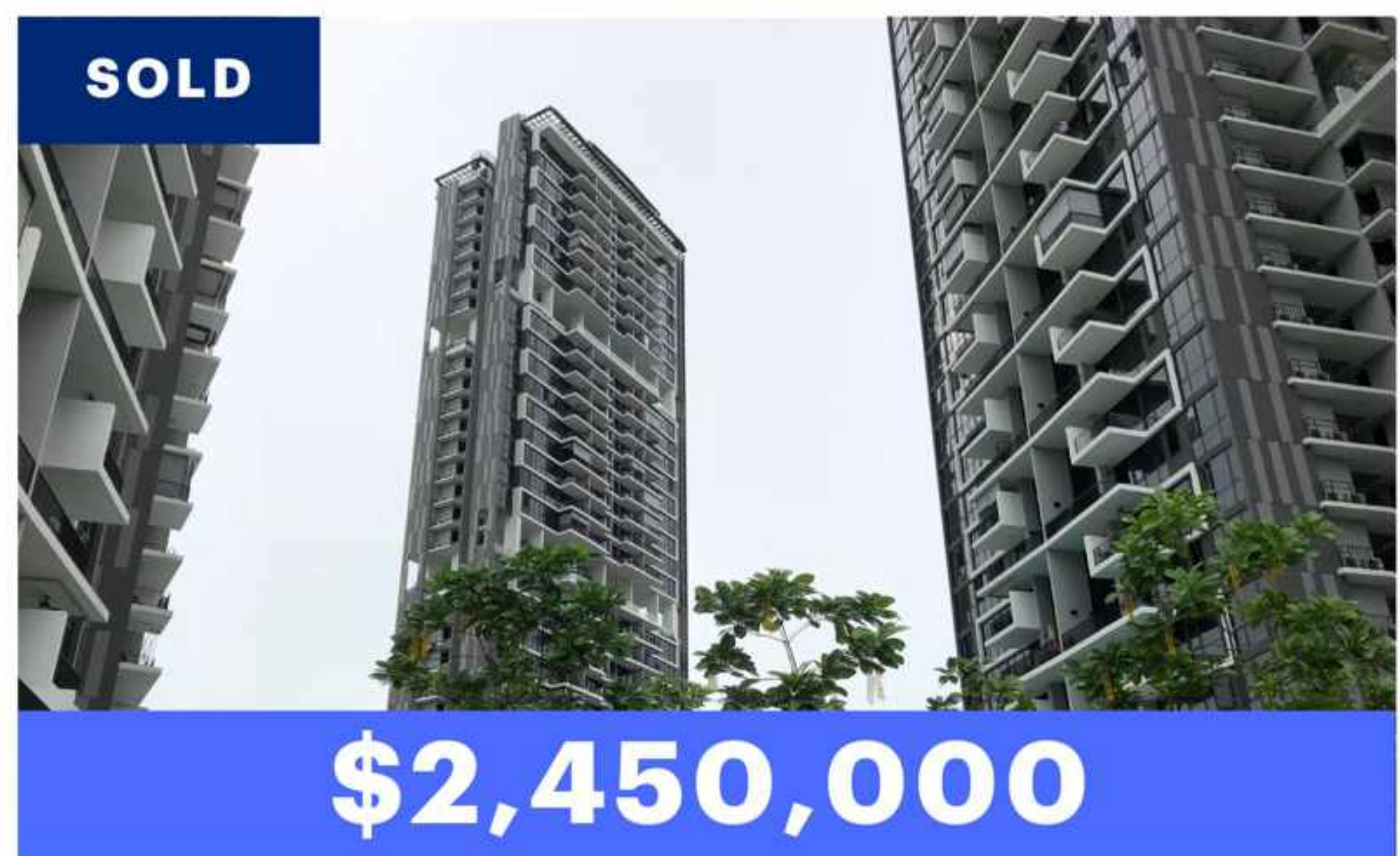
The Triling Residential | 1,518 Sqft