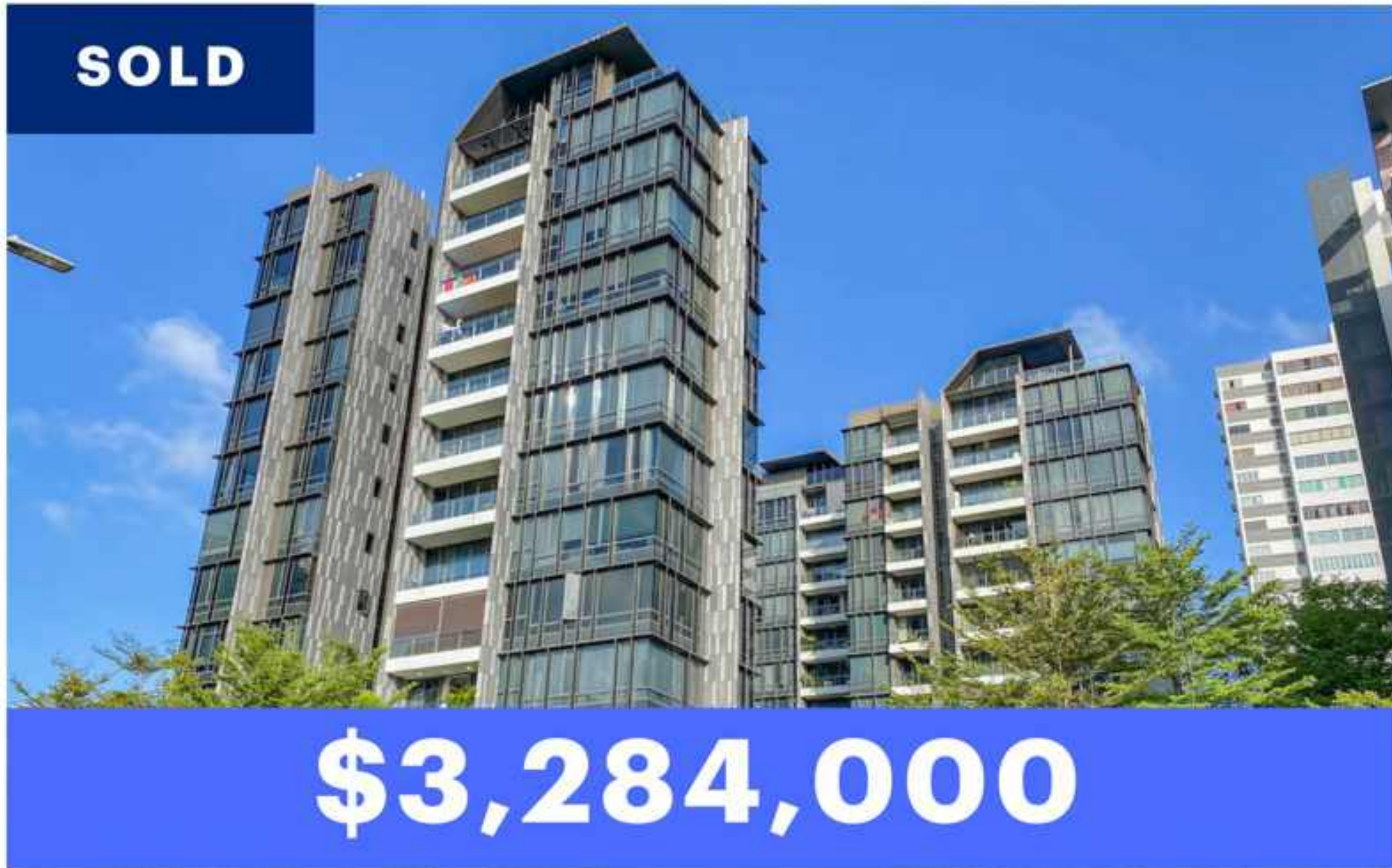
One Balmoral Residential | 1,410 Sqft