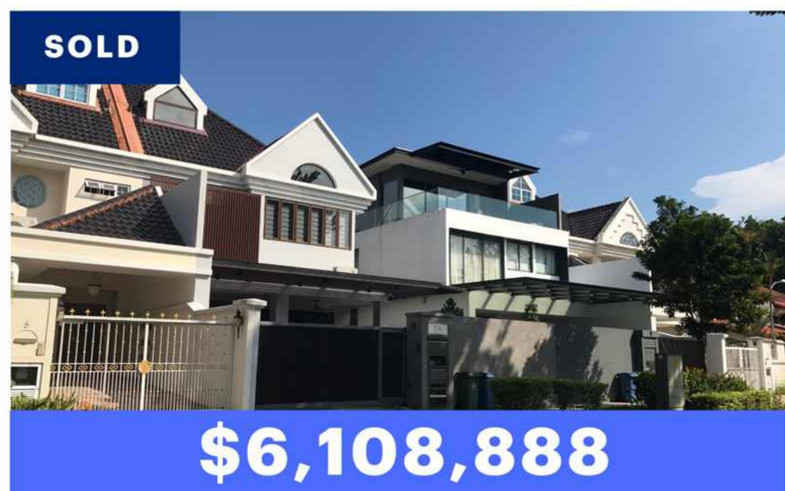
Inter-Terrace @ Kheam Hock Road Residential | 3,057 Sqft