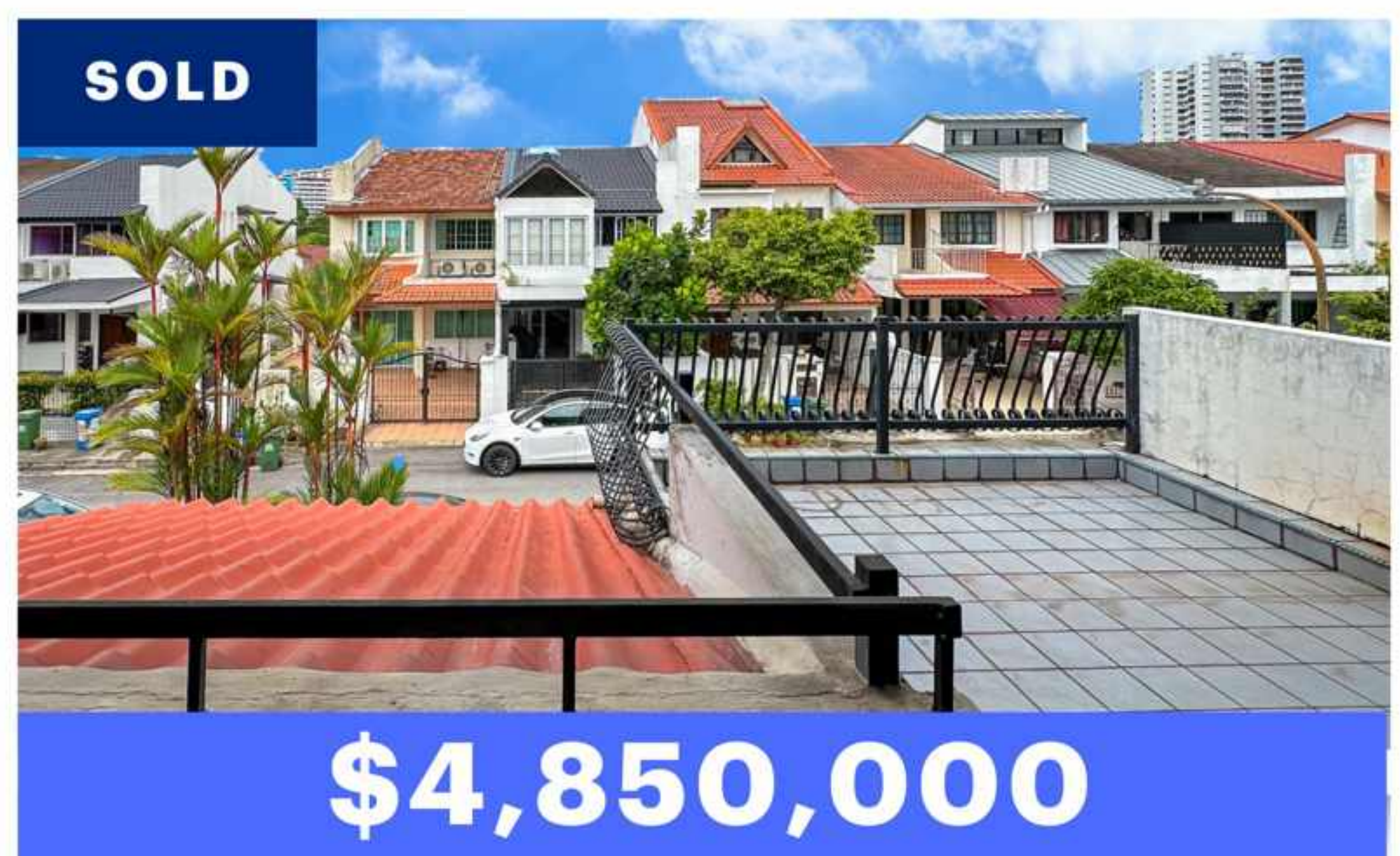
Corner Terrace @ Li Hwan Terrace Residential | 2,517 Sqft