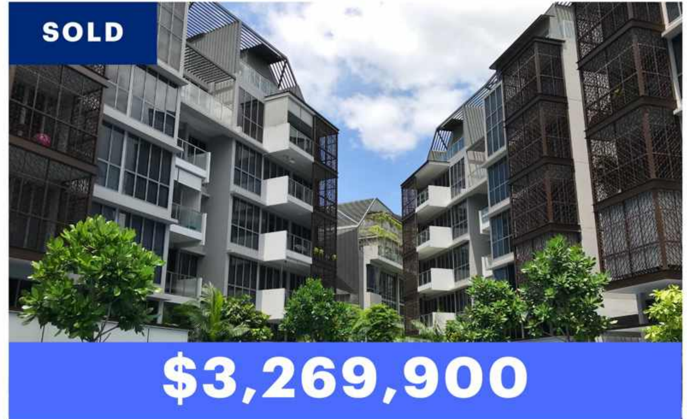
Mon Jervois Residential | 1,475 Sqft