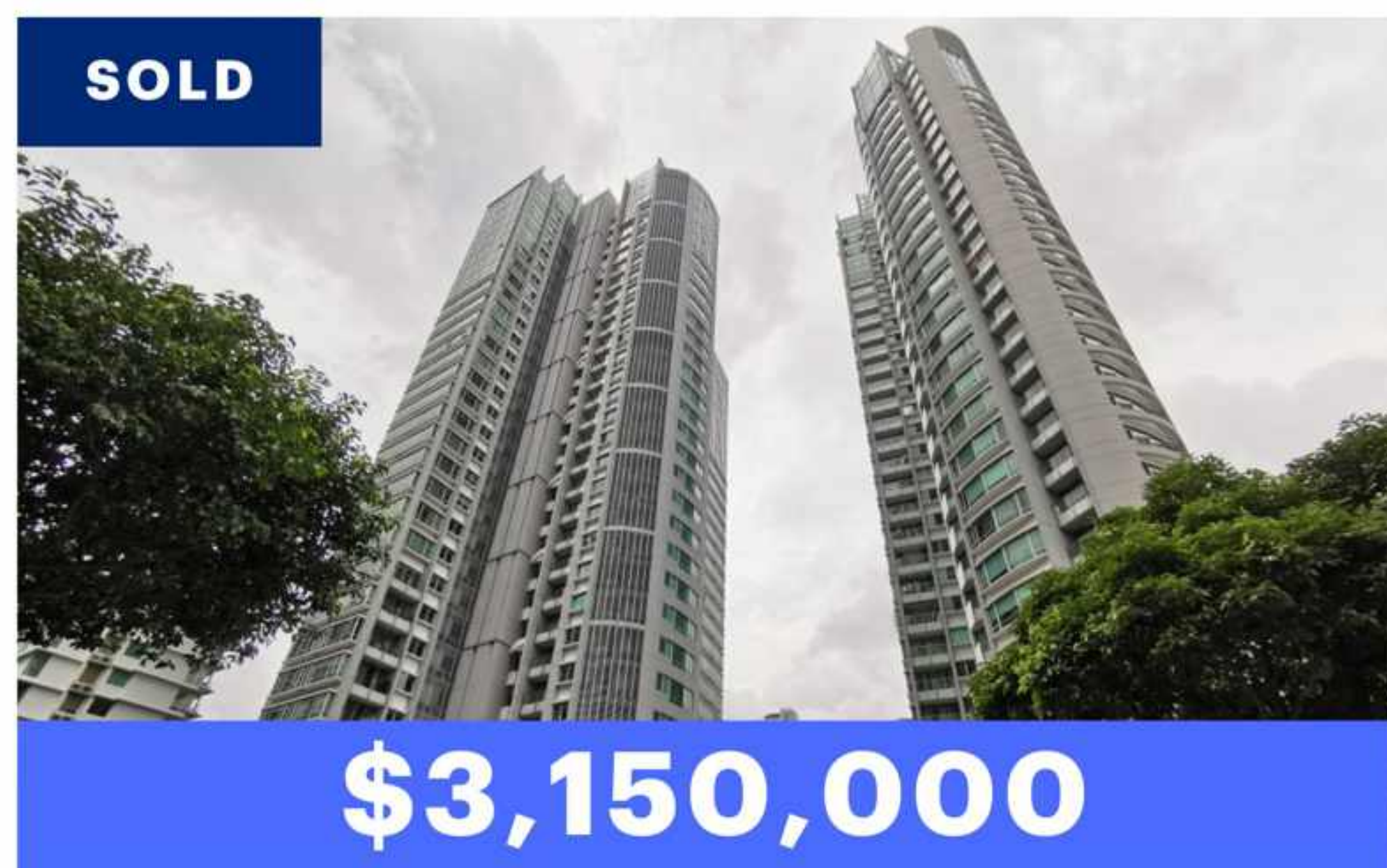
Park Infinia at Wee Nam Residential | 1,464 Sqft